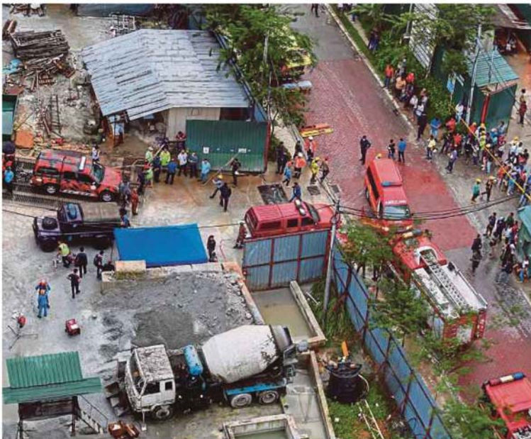
Fire and Rescue Department personnel arriving at the scene in Taman Desa, Kuala Lumpur, on Friday.