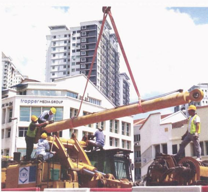
New projects are coming up even within already-developed areas

Of course, this is provided that the economic outlook and property market conditions continue to remain positive.