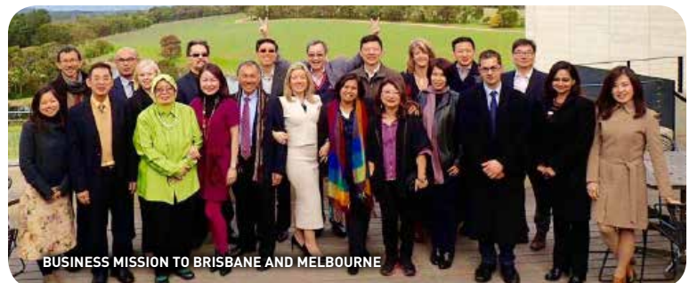
BUSINESS MISSION TO BRISBANE AND MELBOURNE