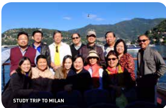
STUDY TRIP TO MILAN