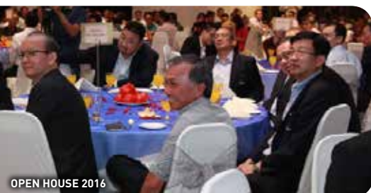
OPEN HOUSE 2016