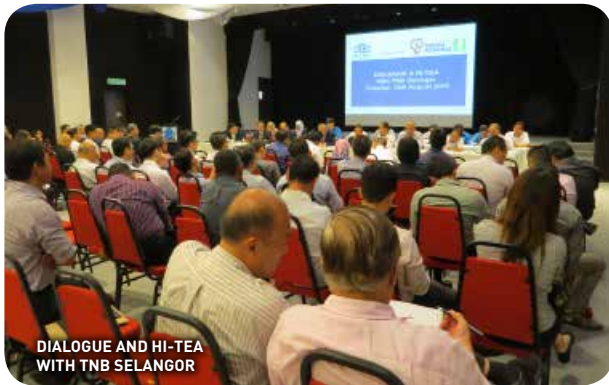
DIALOGUE AND HI-TEA WITH TNB SELANGOR