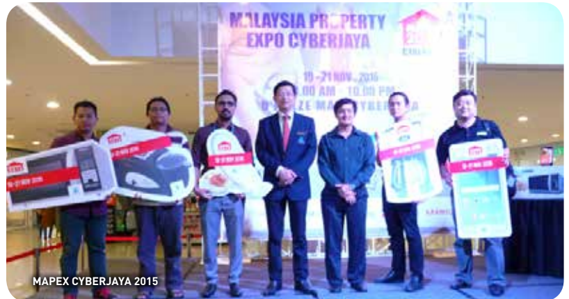
MAPEX CYBERJAYA 2015