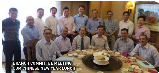
BRANCH COMMITTEE MEETING CUM CHINESE NEW YEAR LUNCH