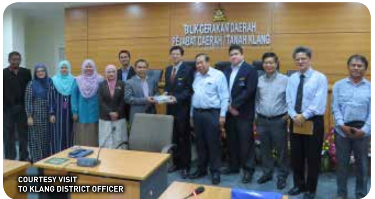
COURTESY VISIT TO KLANG DISTRICT OFFICER