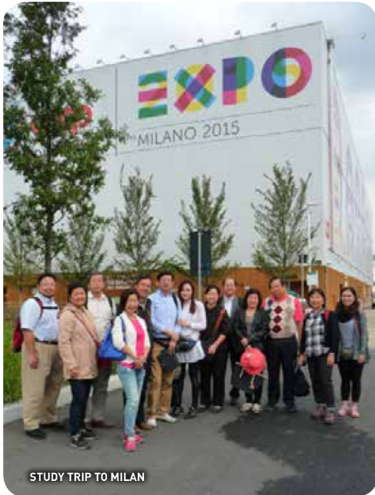
STUDY TRIP TO MILAN