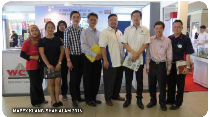
MAPEX KLANG-SHAH ALAM 2016