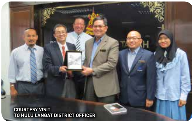
COURTESY VISIT TO HULU LANGAT DISTRICT OFFICER