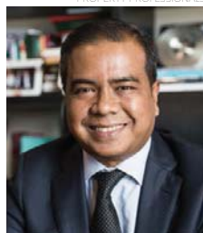
FIRDAUS AND ASSOCIATES PROPERTY PROFESSIONALS

Although the overhang in serviced apartments surged 30.2% in 1Q2020, those that have started construction and newly planned ones have dipped 57.3% and 36.5% respectively. Unsold under construction and unsold not constructed serviced apartment units have also decreased by 11.2% and 32.1% respectively.