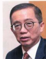
Soam: Loan rejection was more or less equally distributed among houses priced from RM250,001 to RM2.5 million

45% of the respondents said they had affordable housing components (RM100,000 to RM500,000) in their projects in 2H2018.