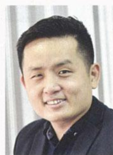
Too much hype on the overhang in the last few months, says Poon

seen from the statistics, are already holding back their projects although there are others who are proceeding with theirs.