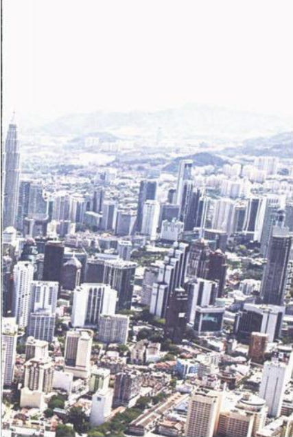
The skyline of Petaling Jaya showing the various commercial, retail, office and residential units. Can the market support more incoming units?