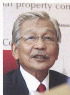
Abdul Rahim sees two possible outcomes following the overhang