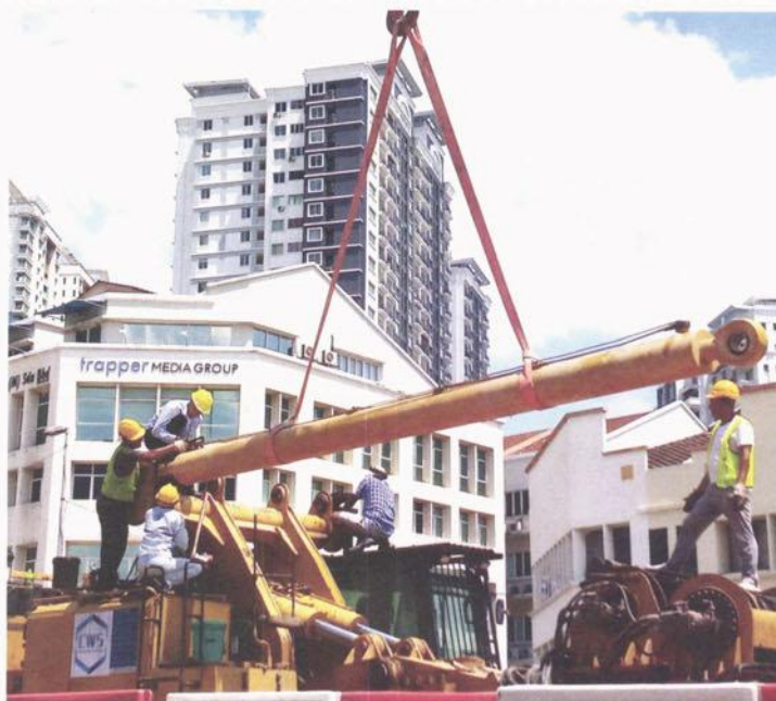
New projects are coming up even within already-developed areas